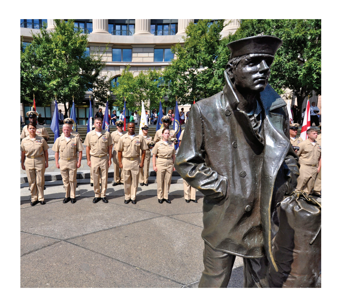
"It is now required that you be the fountain of wisdom, the ambassador of good will, the authority in personal relations as well as in technical applications."